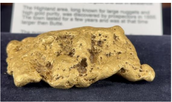
GIANT GOLD NUGGET AT MINERAL MUSEUM TO BE FEATURED ON DISCOVERY CHANNEL

Come see what's new at the Mineral Museum on the Montana Tech campus. Over the winter, the Montana Bureau of Mines & Geology (MBMG) team has been hard at work renovating the Mineral Museum to reorganize and update the collection, while still preserving the important history and heritage of the Museum building. Updates include refinishing the beautiful original flooring, clearing off the stage to create a presentation space for exciting seminars and discussions, and fixing up the old display cases for a better viewing experience of our amazing mineral collection.