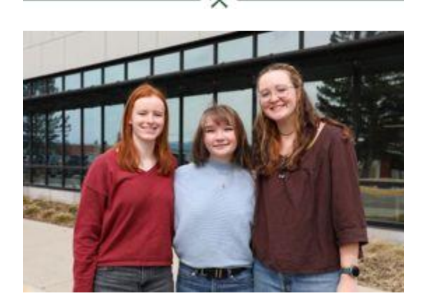
STUDENTS PRESENT ON SILVER LAKE PIPELINE MICROHYDROPOWER PROJECT

Ninety student research and design projects, represented by 168 undergraduate and graduate students, filled the HPER in April for Techxpo, the annual campus-wide event showcasing the hard work, innovation, and excellence of students. Exhibits included projects in science, engineering, and mathematics. A panel of industry professionals judge the students' projects, and the top project in each category is awarded a cash prize. <u>Read more</u>