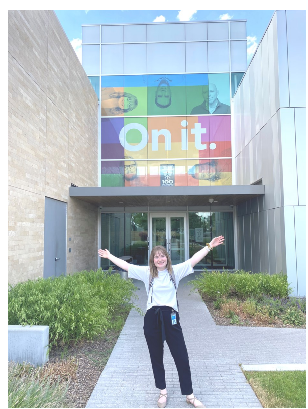
Notice her picture on the screen on the building!

My time at Tech opened many doors for me, and I continue to be thankful for the memories, stories and experiences I have from college. I have met many Orediggers around the country — when I wear a Tech shirt, someone has always stopped me to say they are from Butte, they went to Tech, or they have a relative that goes to Tech. These little moments remind me that the Montana Tech community is large, proud and powerful, and we are all part of it.