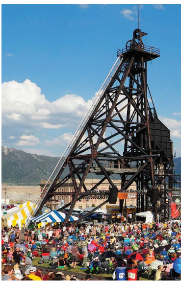
For things to do in Butte, Visit: Visitbutte.com