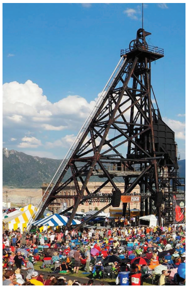
For things to do in Butte, Visit: Visitbutte.com