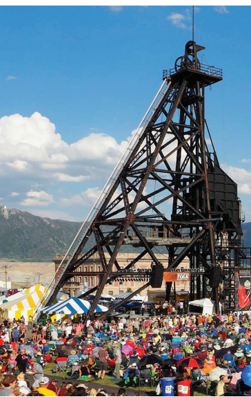
For things to do in Butte, Visit: Visitbutte.com