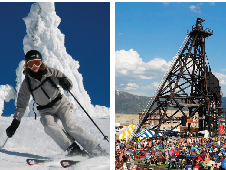
For things to do in Butte, Visit: Visitbutte.com